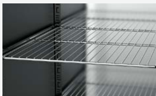
GN2/1 stainless steel shelf