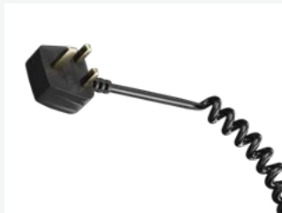
Helicoil mains lead