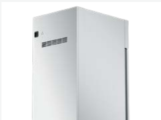
Stainless steel back for island siting