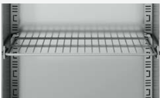
GN 2/1 nylon coated shelf