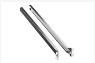
Anti tilt stainless steel trayslides

NB: Please specify all options required at the time of ordering